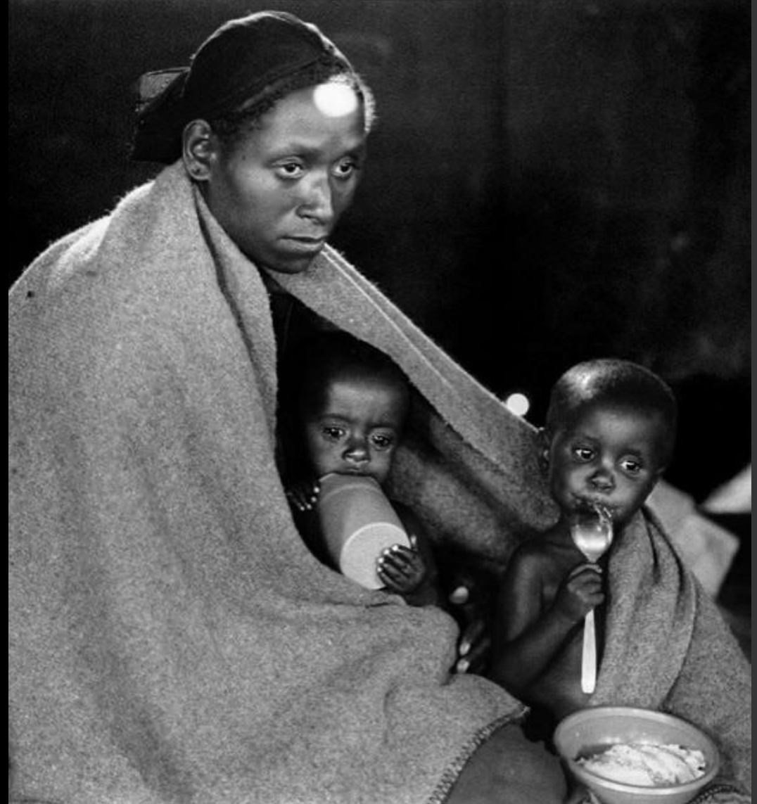
Mother and children: Guba, Ethiopia

In this time of isolation and distress, will you pray for the mothers of the world?