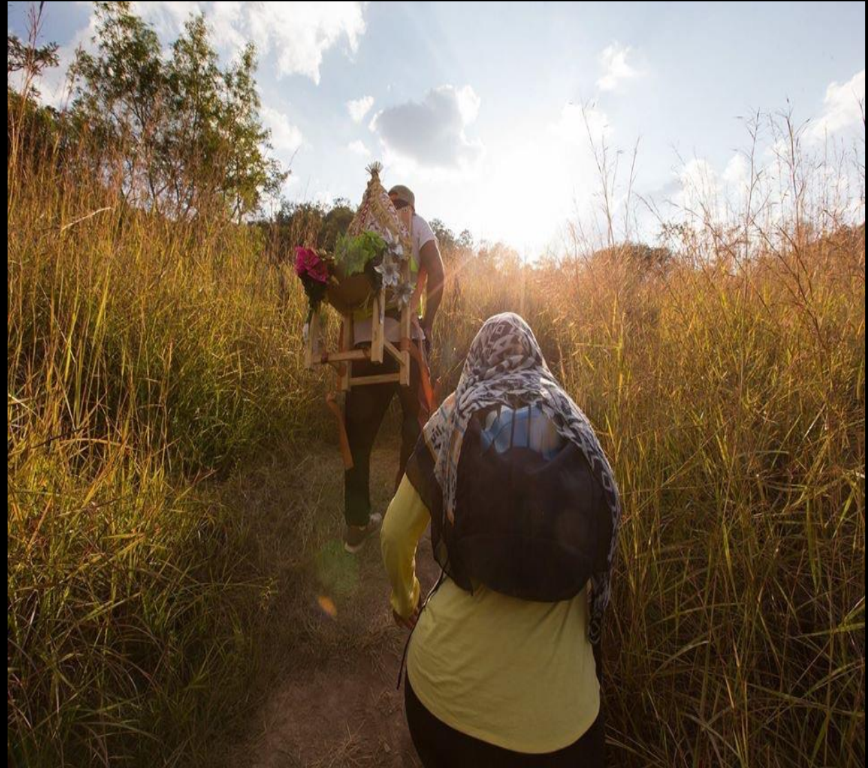
Simon carries the Cross.

In this time of isolation and suffering, what cross will you choose to carry for each other?