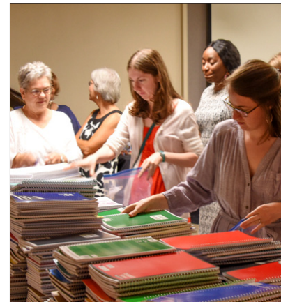
UMCOR school kit assembly.

Many thanks to the children, young people, parents, teachers, members of the Foundation Class and the UMW, and other Belmonsters who donated supplies and funds and worked last Sunday morning to assemble school kits for UMCOR. Those kits will be sent to depressed areas and natural disasters areas so that children in those places can continue to learn. Your generous gifts of supplies, money, and time allowed us to meet our goal of more than 200 school kits.