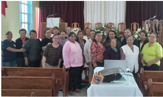
San Matías Atzala, Puebla