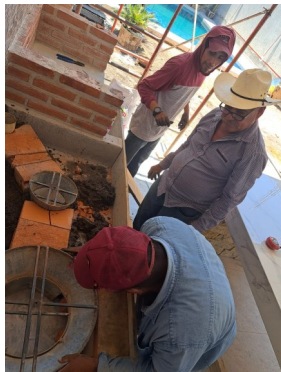
Fuel-efficient mud stove