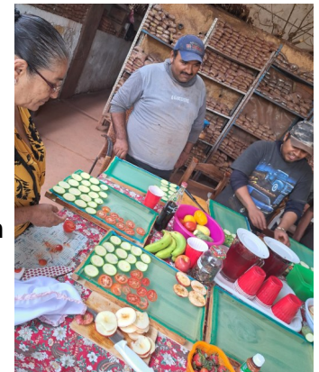
Dehydration of Fruits and Vegetables