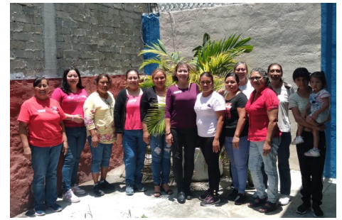
Izúcar de Matamoros, Puebla

are going to have the last Regional Meeting by zoom for those who lived in other states or could not attend to the previous ones. We are expecting 25 or more to join us.